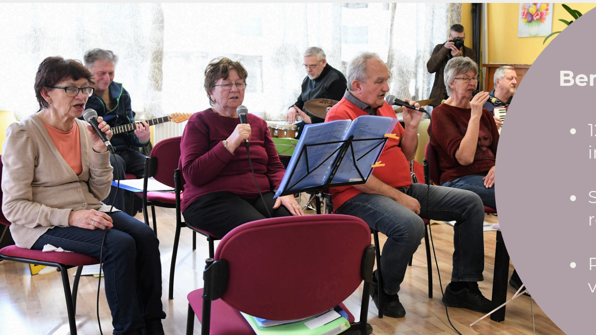
Seniors Band rehearsing at the common room of Totem centre.

The mission of social activation services for seniors and handicapped persons implemented by Totem is to offer programs and projects aiming at preservation of mental and physical strength of the participants.